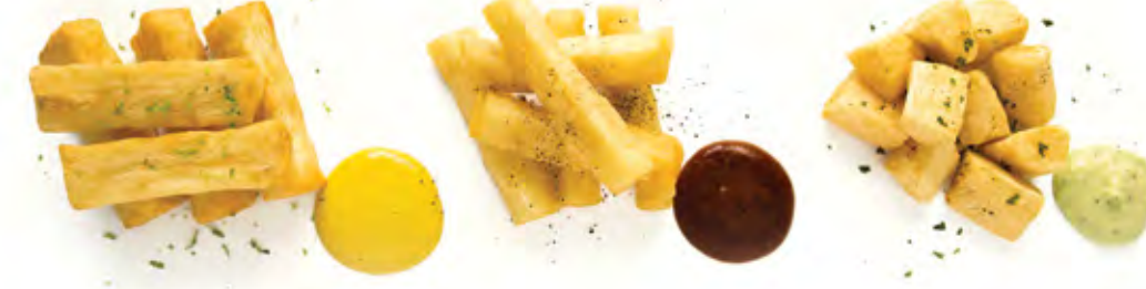
Shown above: Yuca Steak Fries / Yuca Thin Fries / Yuca Croutons