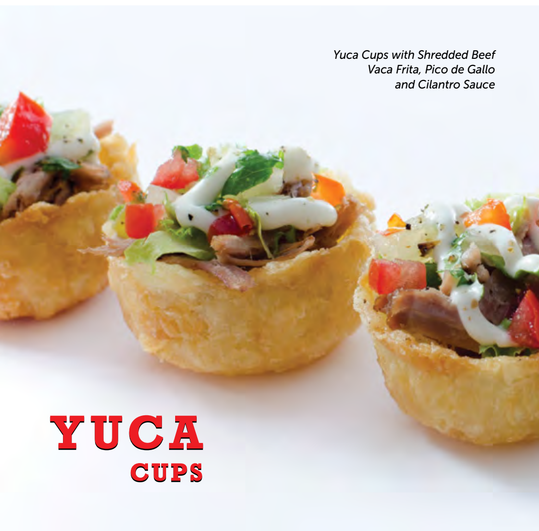
Yuca Cups with Shredded Beef Vaca Frita, Pico de Gallo and Cilantro Sauce