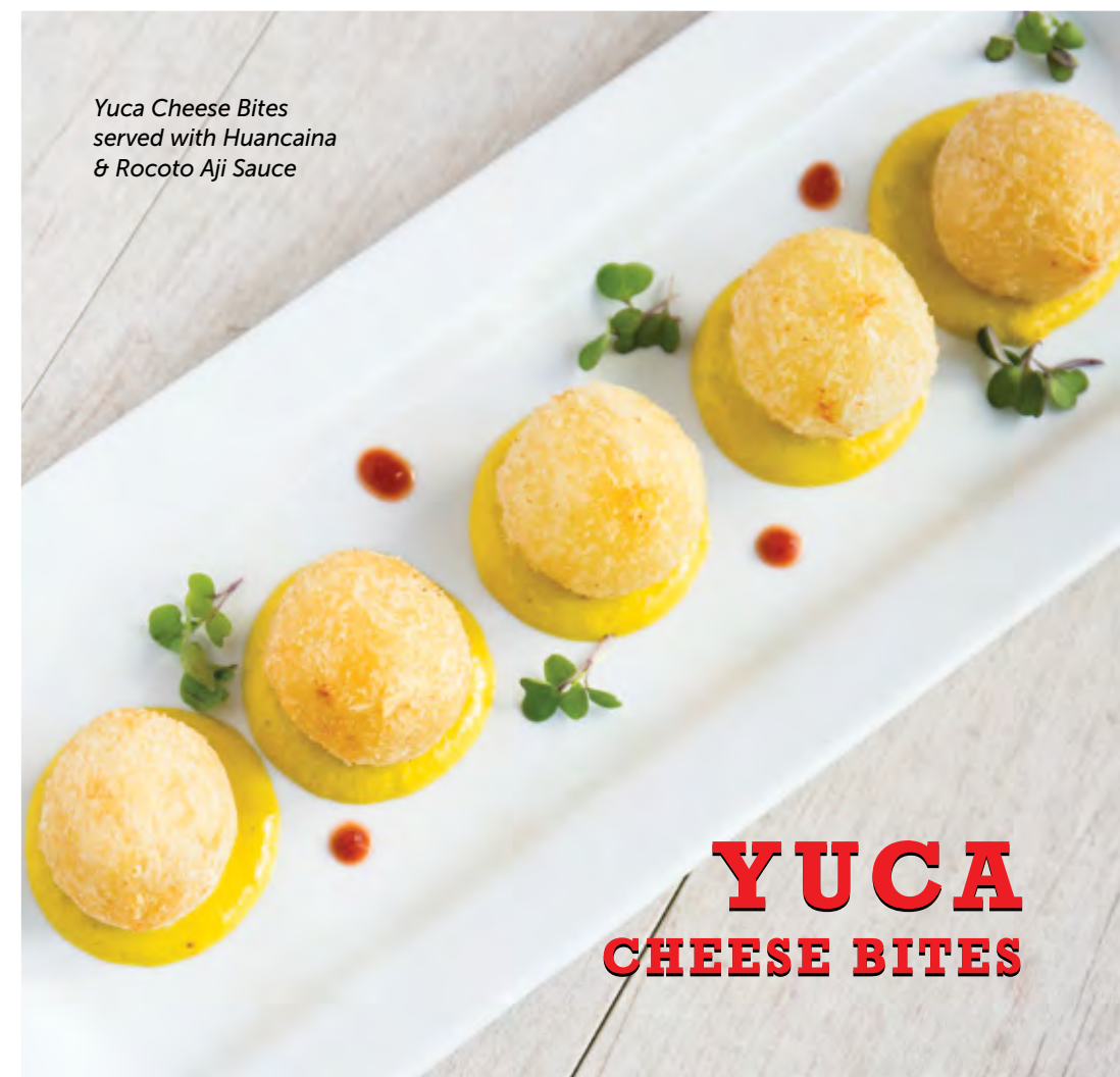
Yuca Cheese Bites served with Huancaína & Rocoto Aji Sauce