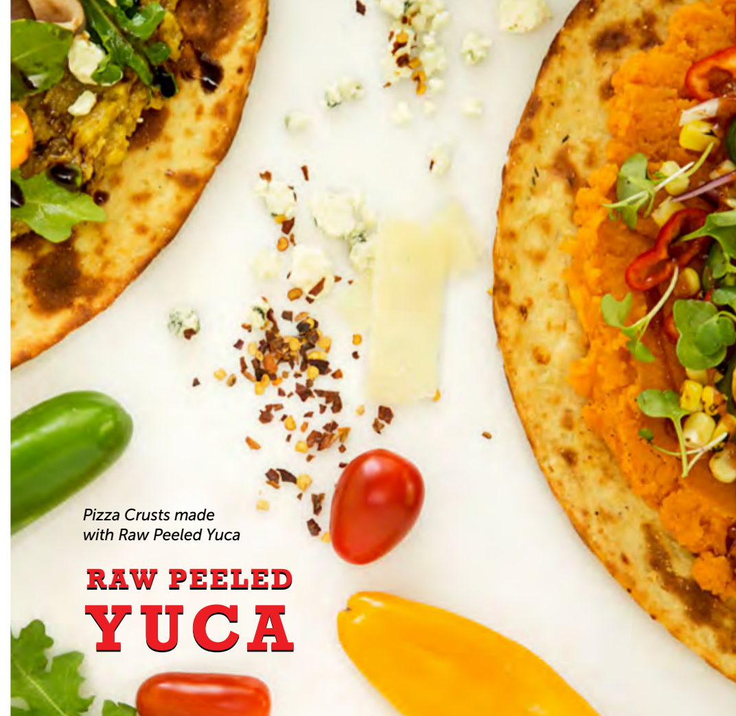
Pizza Crusts made with Raw Peeled Yuca